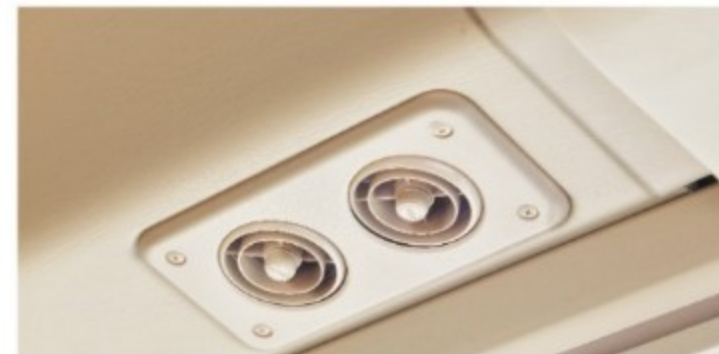
◀ Salida de aire