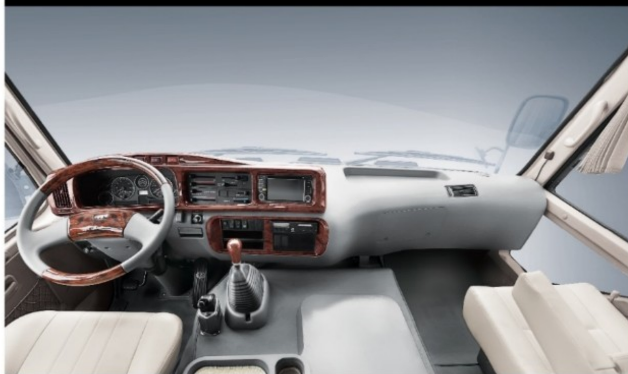
Interior (Optional seat)