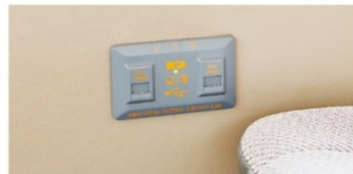
◀ Passenger Door