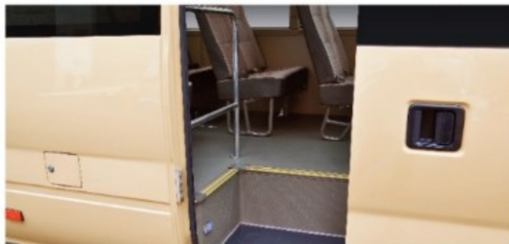
◀ Passenger Door