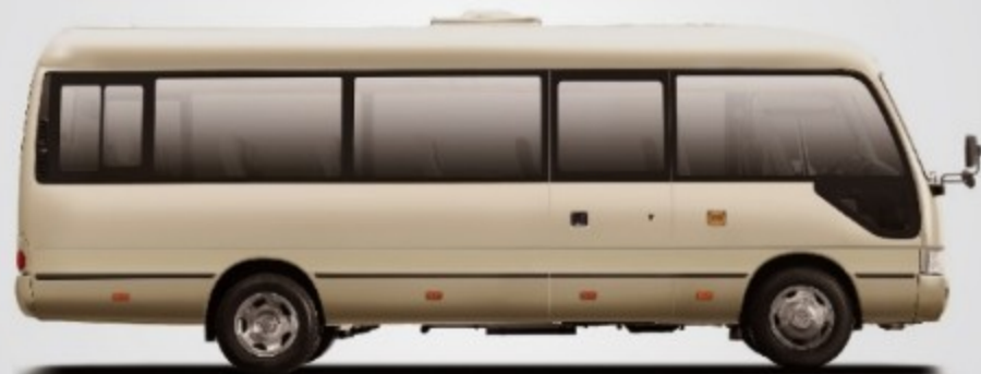
Interior (Optional seat)